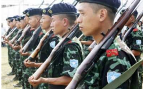
Church funded Nagaland Separatists

“Extremist Hindu nationalists often use generalized and unsubstantiated accusations about conversions to spur anti-Christian violence.”