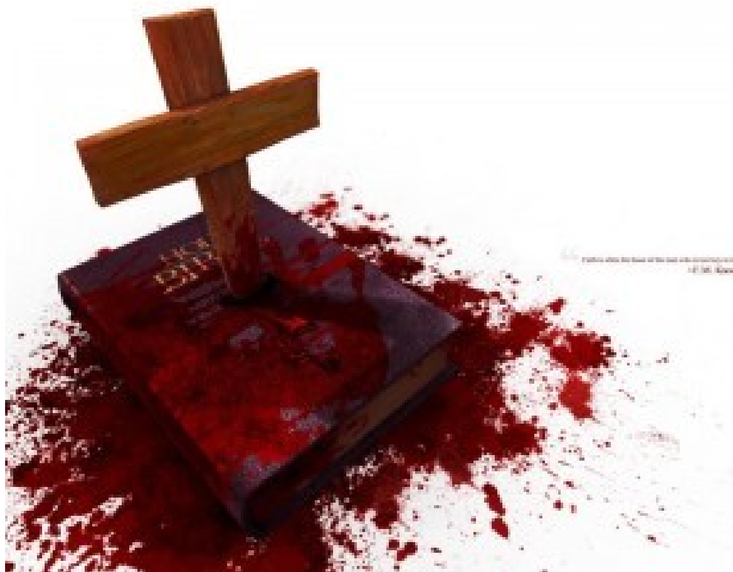
Figure 1: A wooden cross resting on a book, surrounded by a large amount of blood splatters.